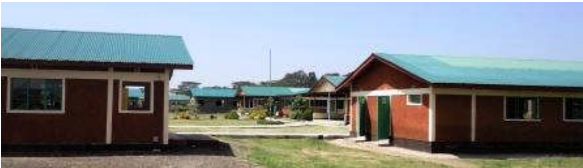
Looking into the quadrangle...