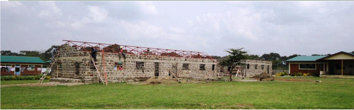
Three more classrooms forming the third side of the quadrangle.

More pathways have been laid according to the natural flow that has been observed.