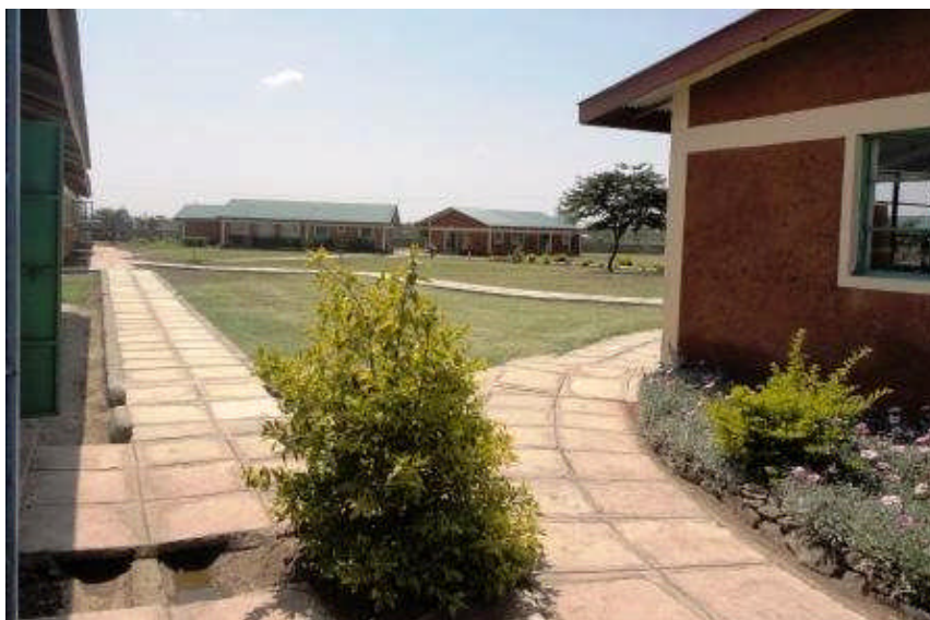
and again with the administration block in the distance.