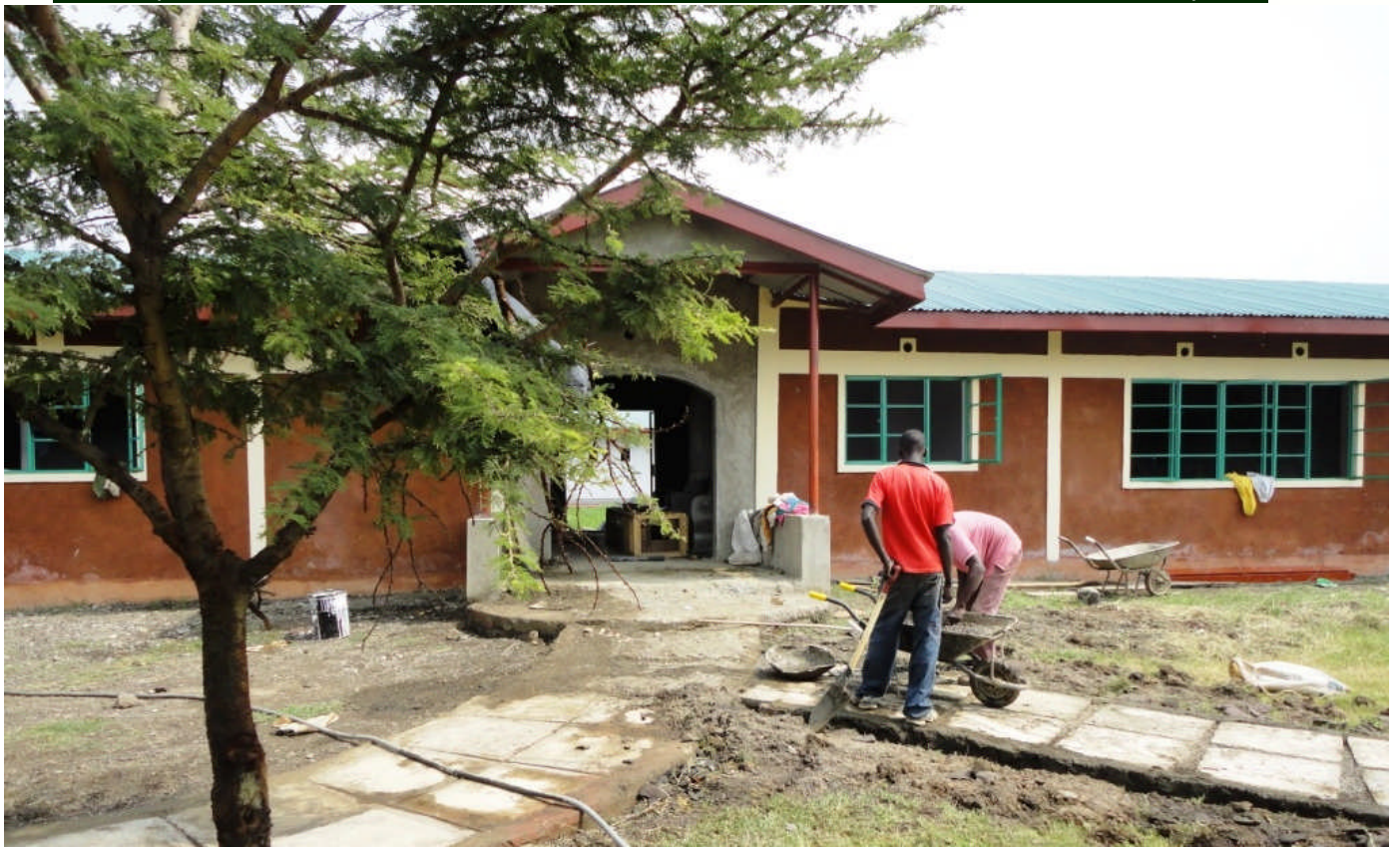
The entrance to the second dormitory block in June.