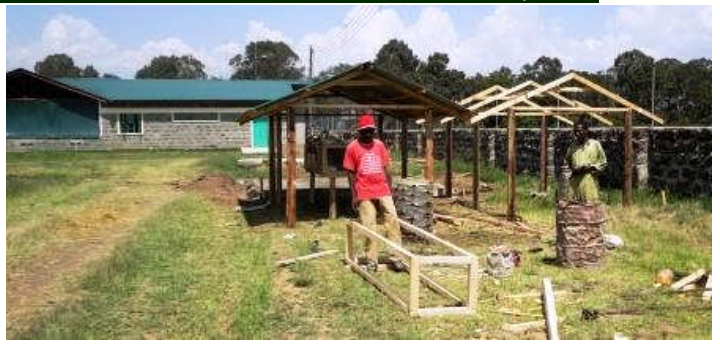
Work on the rabbit hutches and chicken house.

The school is very grateful to Redshank for the use of their tractor and mower to carry out the first cut on the games field.