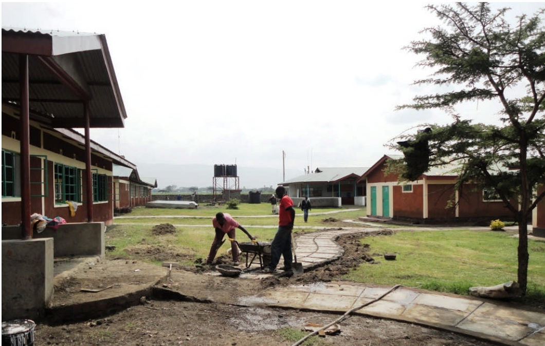
Laying a path outside the second dormitory block.

There are now 112 girls in the school. Learning to organize the increased numbers has been a healthy challenge for the school and will continue to be for the next few years. Systems that work for 100 do not necessarily work for 150 and so on.