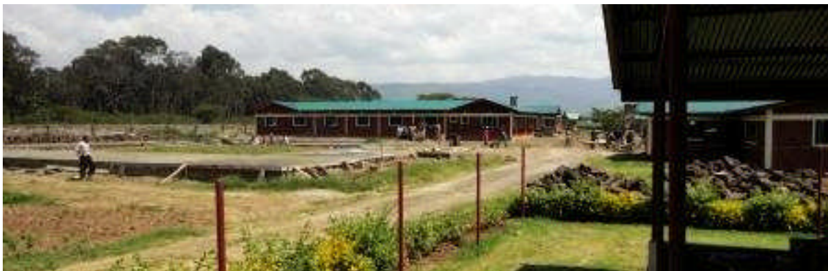
The slab of the third dormitory block is in the foreground.

The Administration Block is nearly complete and looking smart. This will provide a reception area with an office for the bursar and a large study and meeting area that opens out to the quadrangle.