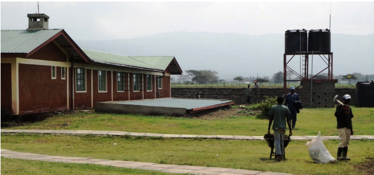
The underground tank with its roof.

The water tank is complete with lining and a new roof. The rain from both dormitory blocks is now directed here. This will provide a vital reservoir for the future. The platform will be extended and one more tank added and then water will be pumped there from underground, from where it can gravitate to all parts of the school.