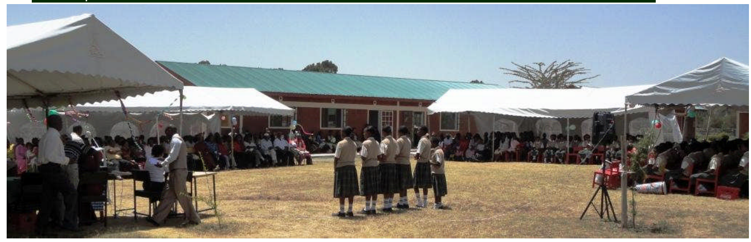
Lining up for prizes, with the new classrooms in the background.