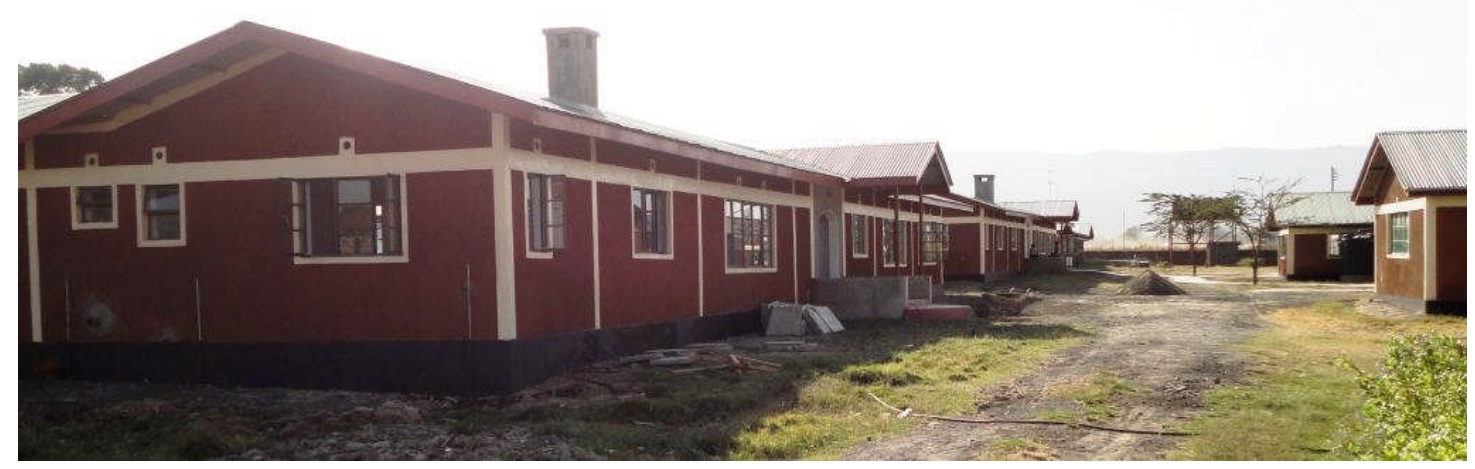
Dorm Block 3 nearing completion.

The kitchen area has been extended and one more stove added. The original concept was that the school would eat in two sittings but this is not practical. The new layout will be easier and safer to use and will be worked on when the school is closed. In addition the storage facilities have been extended to provide capacity to hold enough maize and beans for a year so that the school can store its own harvest and/or buy in bulk when prices are low.