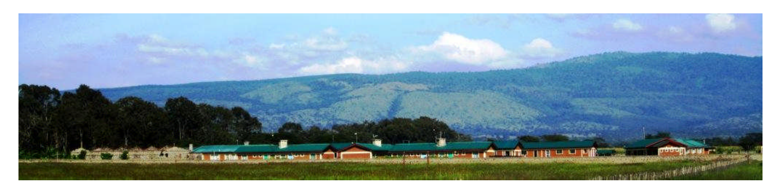
March 2012 dry and dusty.