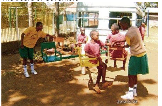
Helping at the VGS