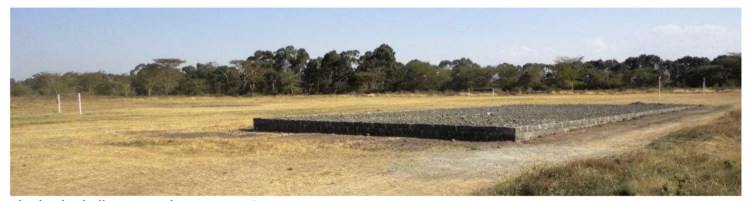
The basketball court under construction.

The Environment: from flood to drought... we are now well into the third month without any rain. Thanks to FOMAWA and the Rift Valley Tree Trust most trees on the field have survived. The importance of creating shade and an attractive area within the wall has been emphasized by the wind and heat. The school needs to find a member of staff prepared to take on this challenge.