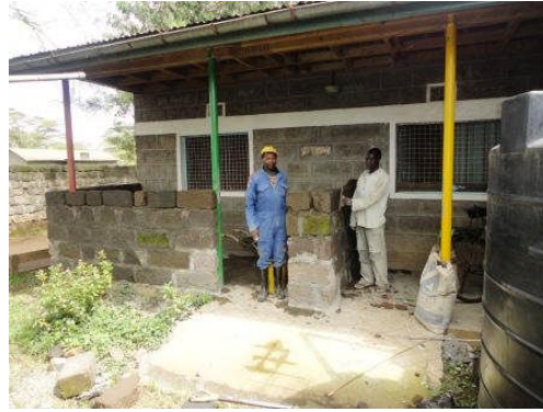
The dhobi for the washing machine