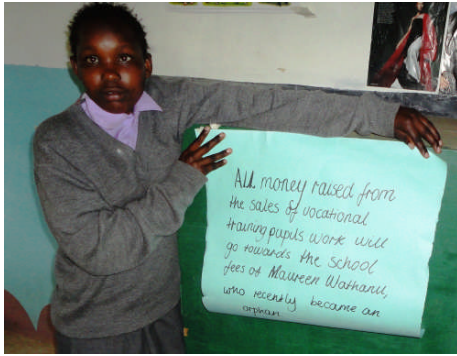
Helping with fees.