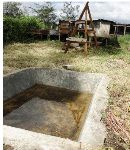
Pond for ducks and geese.