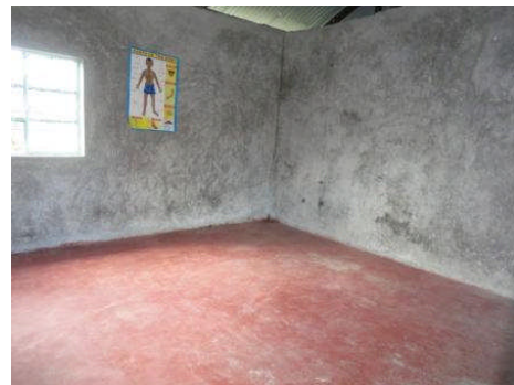
The Vocational Training School with new classrooms approaching completion.