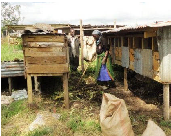
The rabbit hutches and manure preparation.