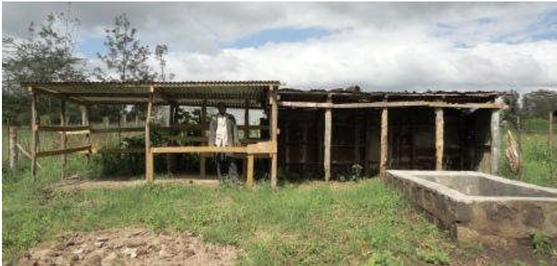
The cow shed for milking and feeding.