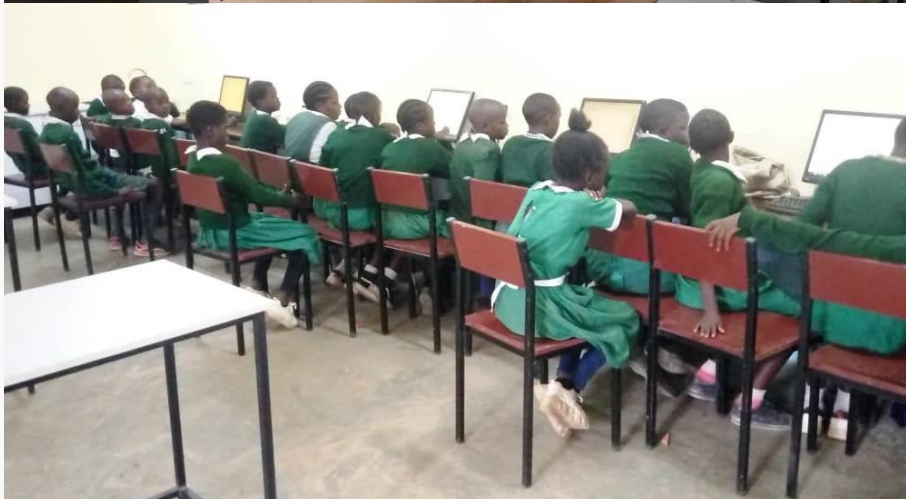
Additional security for the computer room. computer room and temporary science lab.