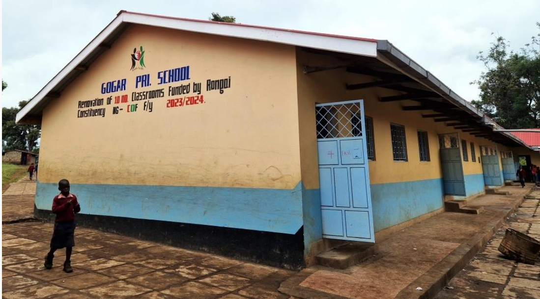
classrooms and roof upgraded thanks to government funds