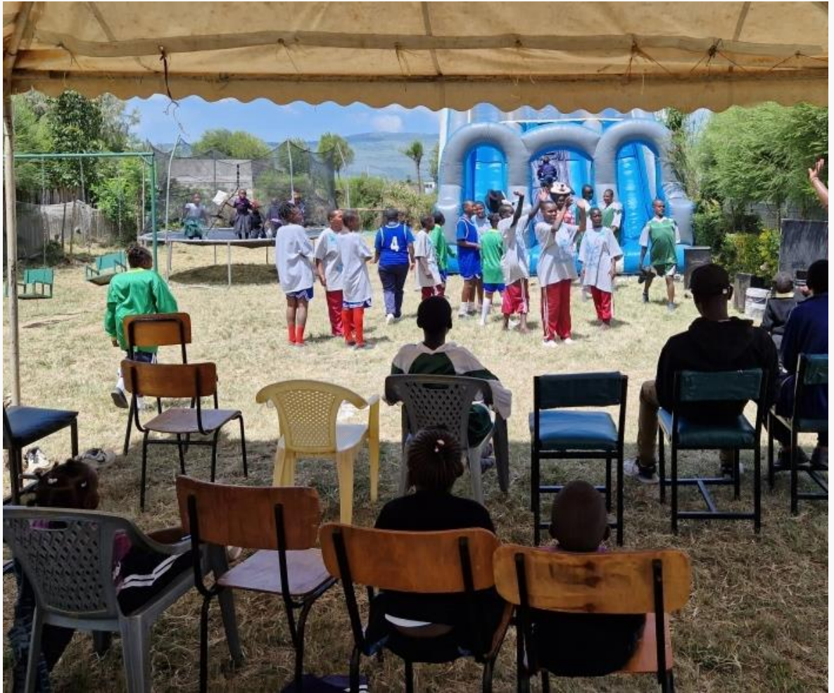
A fun day in February this year.