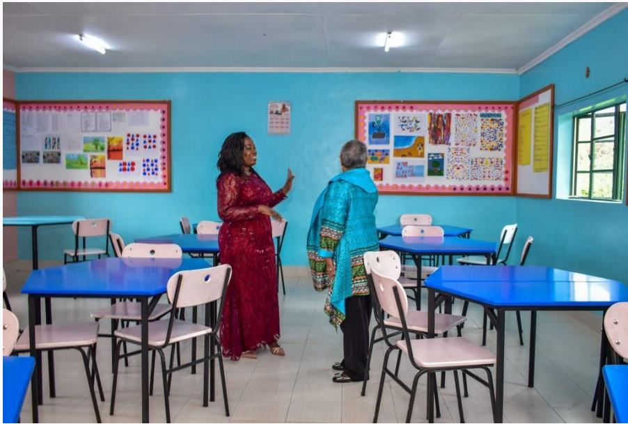
The CBC Pioneers.