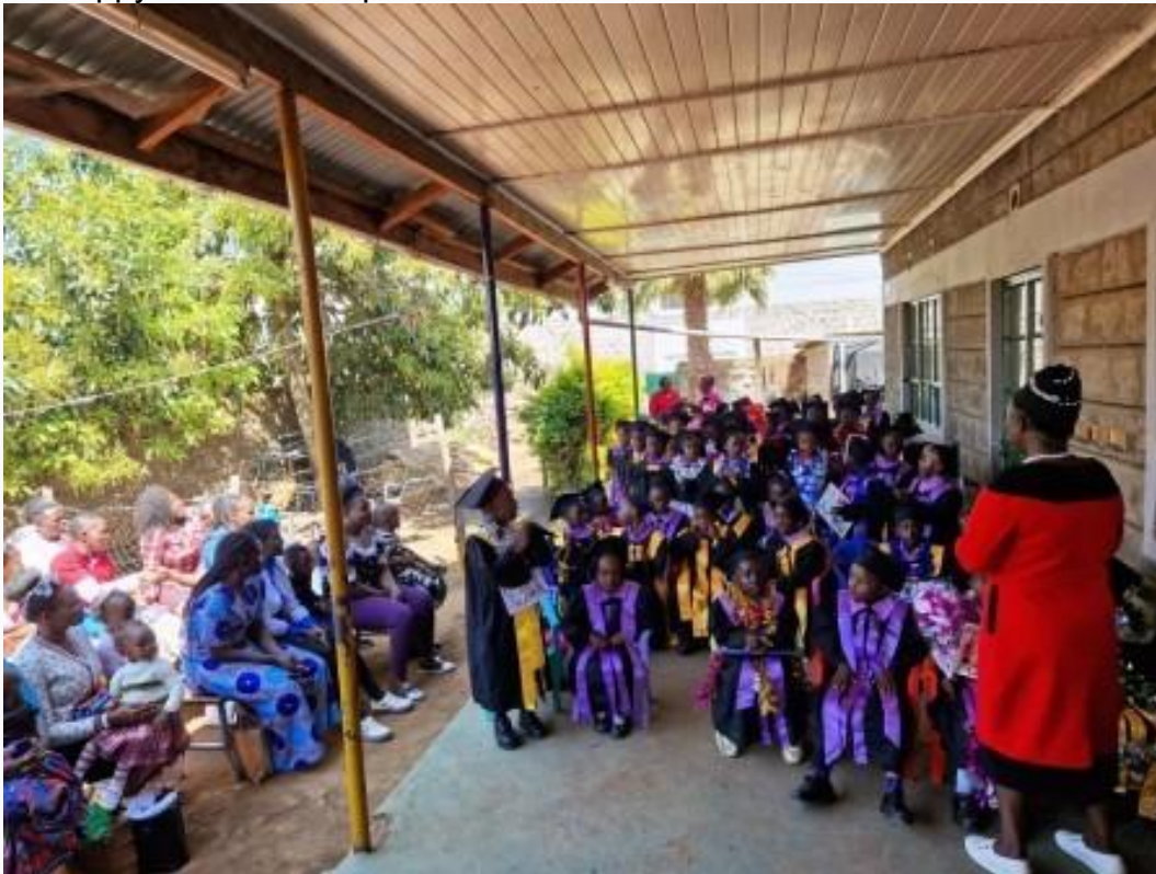
The Four Year Old group 'graduating'.

S Michael's continues to thrive and is in great demand as the nursery school of choice in Rongai. I was honoured to attend the graduation ceremony in October. Lots of happy children and parents.