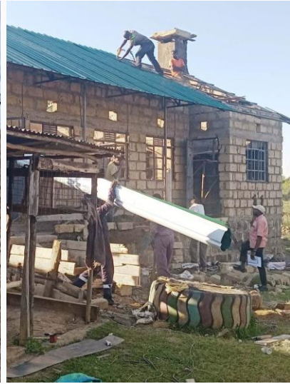
End of October.