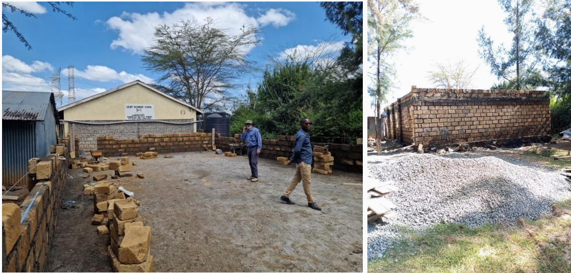
Early December and the slab has been laid and the walls are rising.