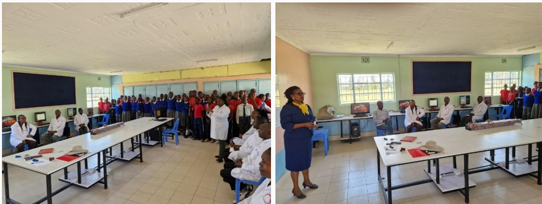
Opening of the computer room at Rongai Primary School in September

This is latest school to be added to the VGT umbrella. The trust has undertaken the refurbishment of a classroom, installation of stabilized electricity access to the internet and provision of 12 computers.