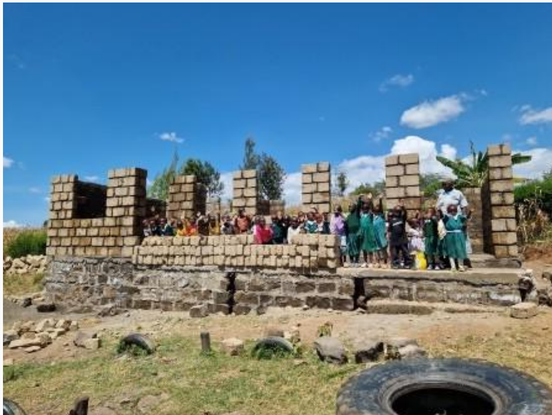
The children in front of the new dining hall mid-October.

Deloraine Nursery Schools: a smart kitchen and dining room is being built at the main nursery school.