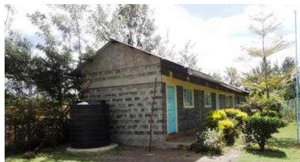
The rainwater tank.