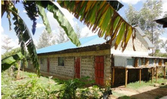
New classrooms with rabbit hutches.

The boarding accommodation is increasing and the extension the teaching facilities is slowly expanding. Unfortunately I forgot to take photos before the school closed for the holidays.