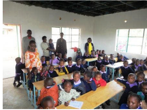
Rushing into class for the first ever lesson.