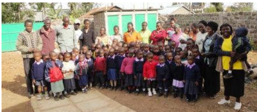
First day of the first term. January 6 th 2012

The next development is a simple kitchen so that lunch can be prepared in a shelter and more fuel efficiently. At the moment there are three stones and a large sufuria (cooking pot).