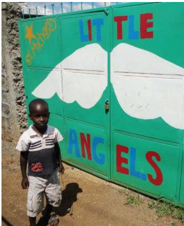
A little angel?